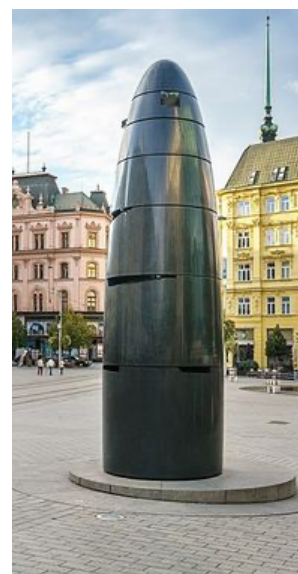
Brno Astronomical Clock (2010)